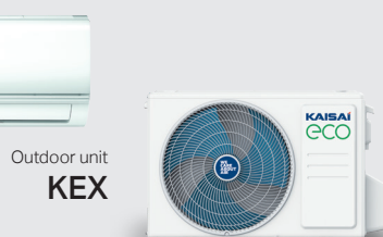
Outdoor unit KEX