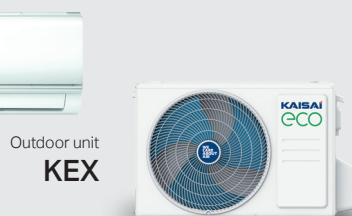
Outdoor unit KEX