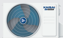
Outdoor unit KLWB