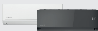
Indoor unit KLW/KLB